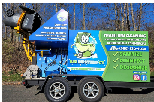
TRASH BIN CLEANING